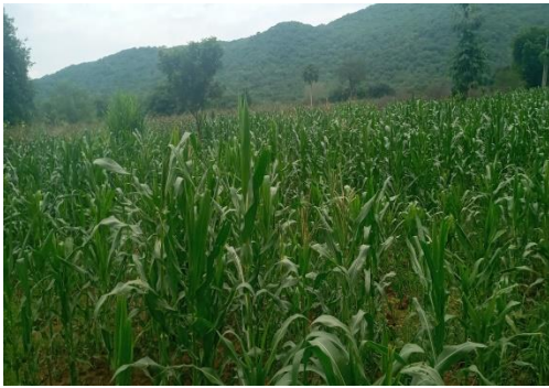
Maize in February 2021 before harvesting