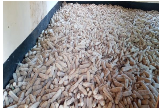
Harvested maize drying

Whilst most of the College students pay annual tuition fees of TSh 700,000, about £280, we continue to sponsor 10 of the 35 College students who are orphans or from very poor families, through the generous, regular donations from our sponsors. These include 6 students sponsored by TWOAT, the Tadworth and Walton Overseas Aid Trust. In addition to the older College students, half a dozen young orphans live at the College and are sponsored to go to the village Primary and Secondary Schools.