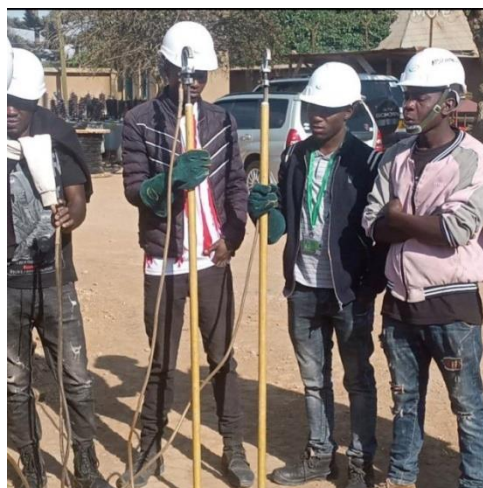
Past Electrical Students

Feedback from past students shows that they have all ended up with very good, well paid jobs. Many of the electrical students end up working for TanESCO, the state power company equivalent to UK's National Grid.