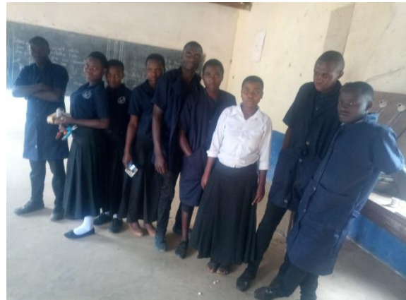
Second Year Electrical Students

Feedback from past students shows that they have all ended up with very good, well paid jobs. Many of the electrical students end up working for TanESCO, the state power company equivalent to UK's National Grid.