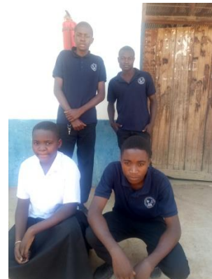
Students sponsored by A in A