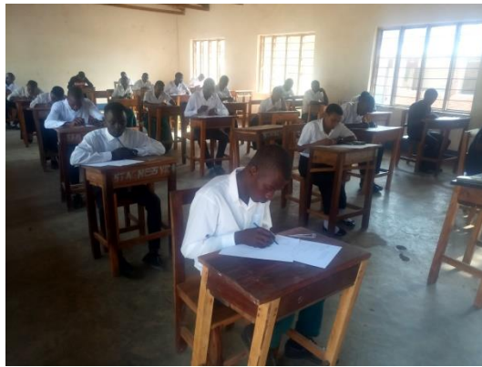
Students sitting the mock exams

2020 in Mtandika has obviously been overshadowed by the corona virus in two main respects. All schools and colleges throughout Tanzania were closed for a couple of months during April and May but reopened in early June. Most of the students returned when the college reopened, although a few were affected by reduced funds being available because of reduced parental income. Some additional funding has been considered to help such students. It remains to be seen whether the reduced tuition period because of the college closure, will affect the results in the upcoming December VETA exams but results of the mock exams in September were very encouraging.