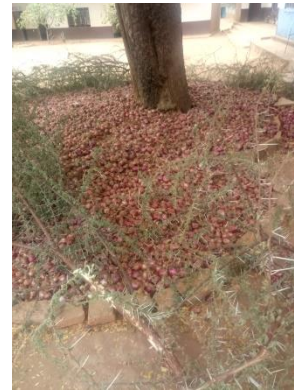
Onions drying in the sun

As well as maintenance of large machines around the college, five computers have been upgraded for use in IT lessons. In addition VETA now requires students to sit at single desks, rather than double desks, so 32 smaller desks had to be made during the year.