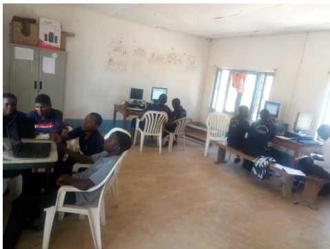
Computer lesson in progress

As well as maintenance of large machines around the college, five computers have been upgraded for use in IT lessons. In addition VETA now requires students to sit at single desks, rather than double desks, so 32 smaller desks had to be made during the year.