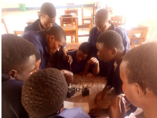
Students studying an electrical circuit

The tailoring and electrical courses are both now well established, with 32 students in total spread over two years. During their courses the students have two periods of practical fieldwork. The electrical students are attached to large local firms or TANESCO [Tanzania Electrical Supply Company]. During their normal college studies they carry out practical work on electrical systems around the college. This year this has included major maintenance of the maize milling machine and solar water pump. The students on the tailoring course are attached to large clothing suppliers during their fieldwork and gain invaluable insight the world of fashion. None of the students have any problem finding very good jobs when they graduate.