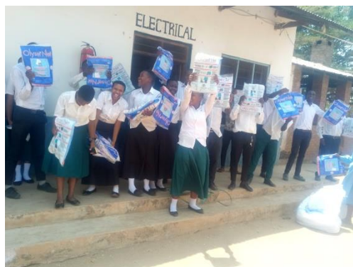
The students showing off their mosquito nets

During the year the Diocese of Iringa kindly donated mosquito nets for all the students and staff as part of a Government project to improve health in all schools and colleges.