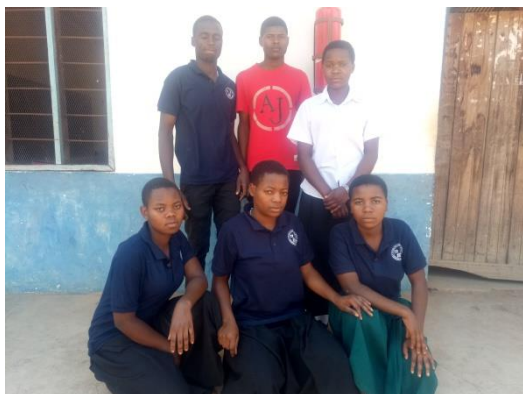
Students sponsored by TWOAT

The second effect of the coronavirus has been the lack of funding possibilities since March, with the cancellation of the usual summer Garden Party and November Quiz due to Government restrictions on meetings. This will result in a shortfall of some £5000. Obviously costs in supporting the college and sponsored students still continue and we have been very lucky that monthly donations continue to be received from our many, regular, long term donors. Some 10 of the 32 college students who are orphans or from very poor families, are sponsored through these regular donations. We also continue to receive generous support from the Tadworth and Walton Overseas Aid Trust [TWOAT] with their assistance for teacher's salaries and fees for 6 of the 10 poorer college students.