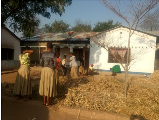
Students hulling beans

The students continue to follow Sister Barberina's philosophy of maintaining the college's self-sufficiency in terms of growing as much of their own food as possible and excellent crops of maize, cassava, rice, beans, onions, tomatoes, bananas and papayas have been harvested this year. Any surplus items, such as onions, are sold to provide a small income for the school. Livestock such as chickens, ducks, pigs and rabbits, as well as fish, continue to provide occasional nutrition for the students, as well as an income for the college.