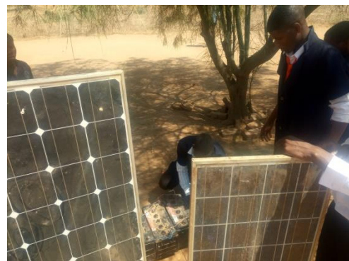
Students inspecting solar panels